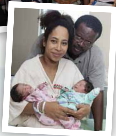
The Newborn Club