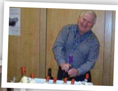
Wine Auction in the Montfort Hospital Auditorium

For the occasion, the Montfort Hospital Foundation teamed up with the Hospital's Continuing Medical Education Office to ensure the event's success. A total of $93,450 in sponsorships was raised for this activity.