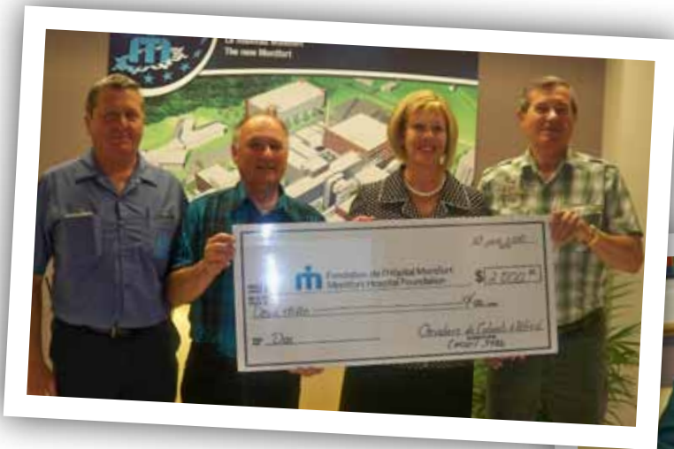
The Knights of Columbus of Alfred - Council 3486 present a cheque of $2,000 to the Foundation