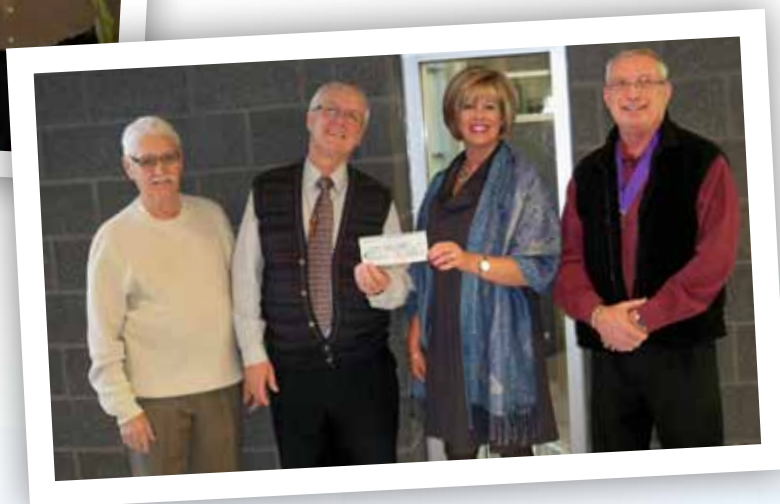
The Knights of Columbus of Montfort – Council 7190 donates $1,250 to the "Montfort Discovers Everest Challenge"