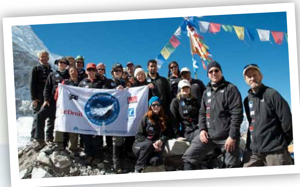
Participants of the "Montfort Discovers Everest Challenge"