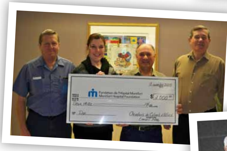
The Knights of Columbus of Alfred – Council 3486 present a cheque of $2,000 to the Foundation