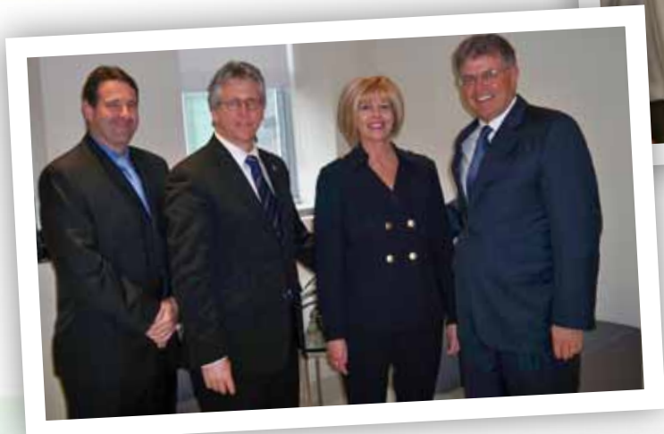
Coughlin & Associates donates $5,000 in support of the Montfort Discovers Everest Challenge