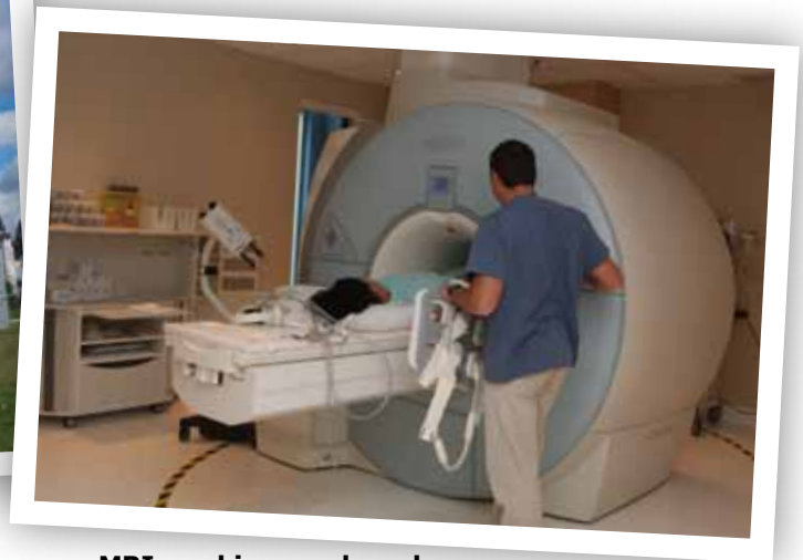
MRI machine purchased by the Foundation