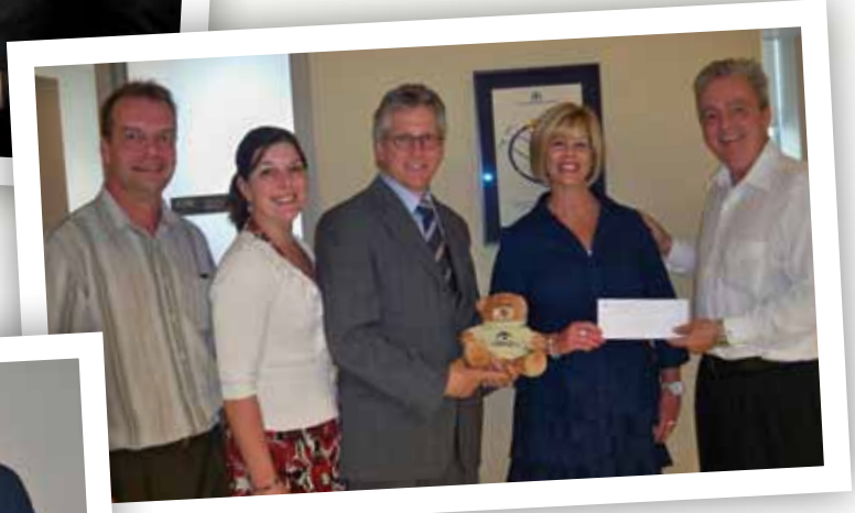
The Heritage Manor presents the profits of the "Brunch de l'Ascension" in support of the "Montfort Discovers Everest Challenge"