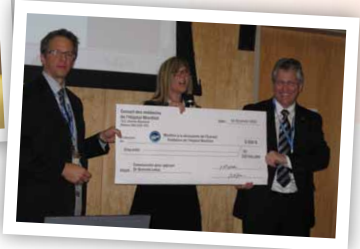
The Medical Council presents a $10,000 cheque in support of the "Montfort Discovers Everest Challenge"