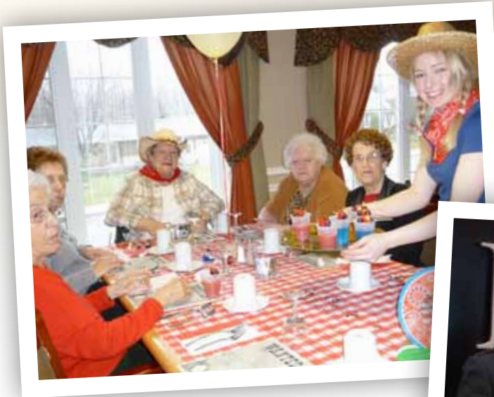
Western Gala in support of the "Montfort Discovers Everest Challenge", organized by Belcourt Manor