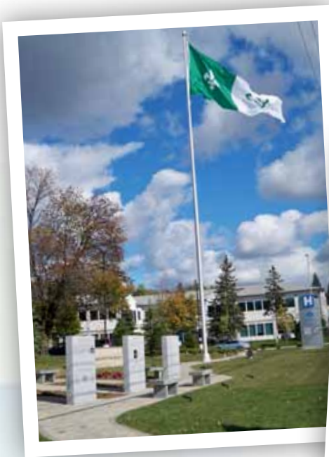
Monument de la Francophonie at the Montfort Hospital

During the year, the Foundation made a significant contribution to improving care and service by providing leading-edge technology to the clinical staff. During the fiscal year, the Foundation made a donation to the hospital in the amount of $492,000, which represents the monthly reimbursement payments for the long term loan due in 2015 for the Magnetic Resonance Imaging machine (MRI).