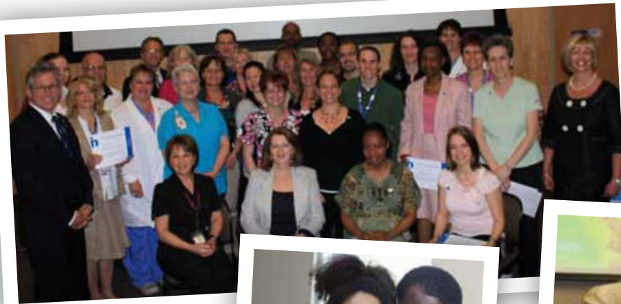
The Angels of the Montfort Hospital

A partnership was reached between the Montfort Hospital Foundation and La Cité collégiale Foundation for the creation of two new bursaries totalling $45,000, to support Francophone students in the fields of Respiratory Therapy and Medical Electroneurophysiology Techniques. Each of the bursaries provided by