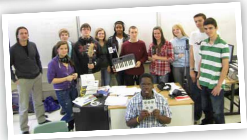
Students from grade eleven of l'École secondaire catholique Garneau produced a Christmas song in support of the Montfort Hospital Foundation